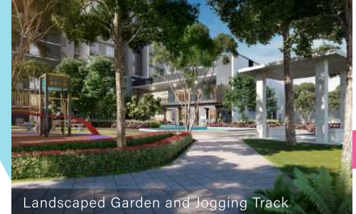
Landscaped Garden and Jogging Track