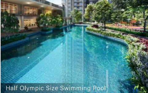
Half Olympic Size Swimming Pool